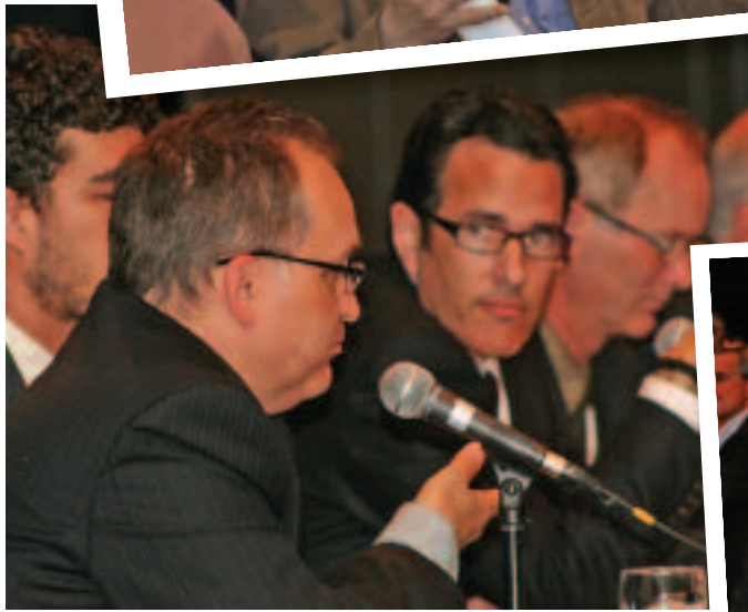
Panelists participate in the Plenary.