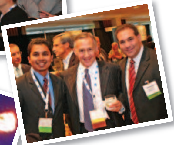
Exhibit Hall Grand Opening Welcome Reception