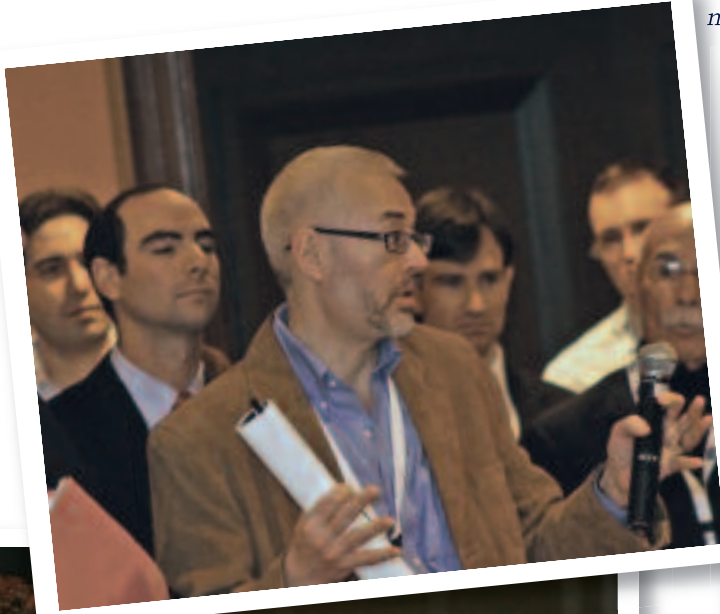
Attendees participate in the moderated poster session.