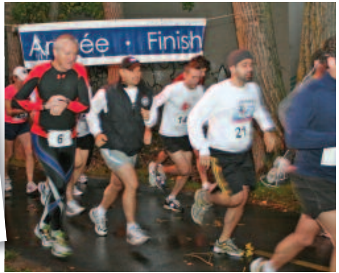
And they're off! Runners start the 5K Run for Residents on the scenic Lachine Canal.