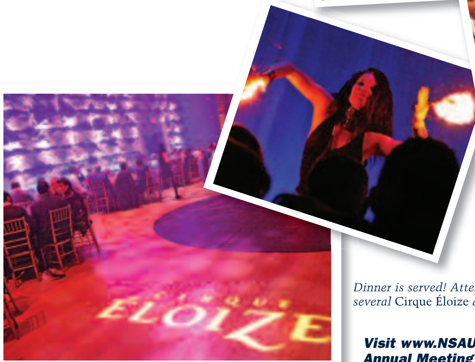
Dinner is served! Attendees enjoy dinner before viewing several Cirque Éloize acts.

Visit www.NSAUA.org to view and order more Annual Meeting pictures.